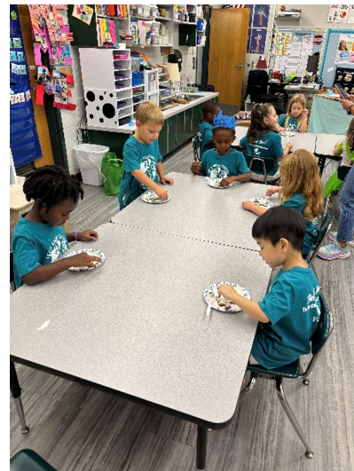
Decorating our gingerbread cookies